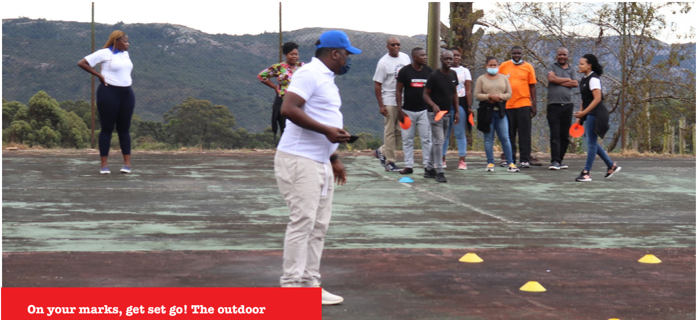
On your marks, get set go! The outdoor activities during the team building exercise