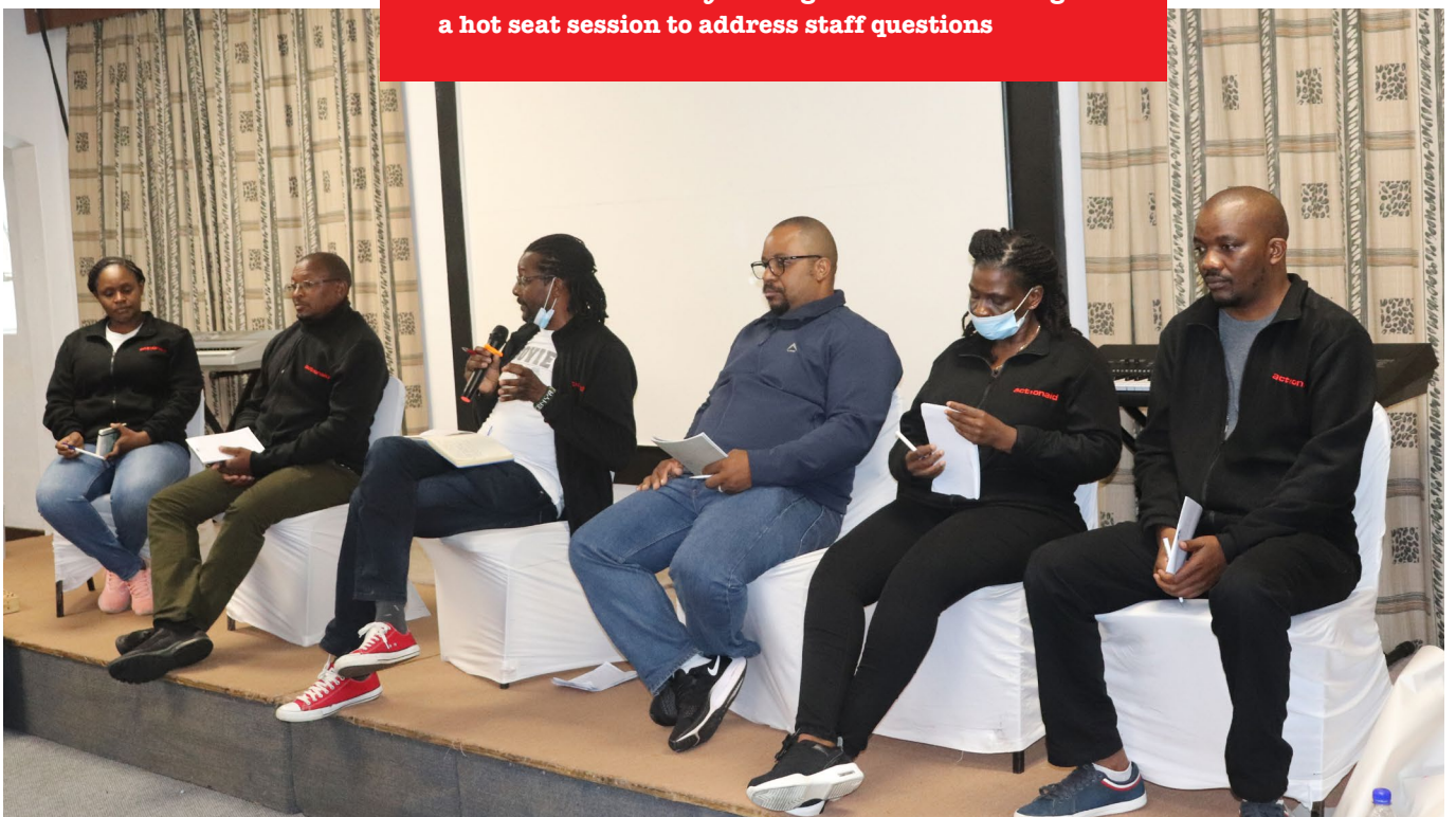
BELOW: AAZ Country Management Team during a hot seat session to address staff questions