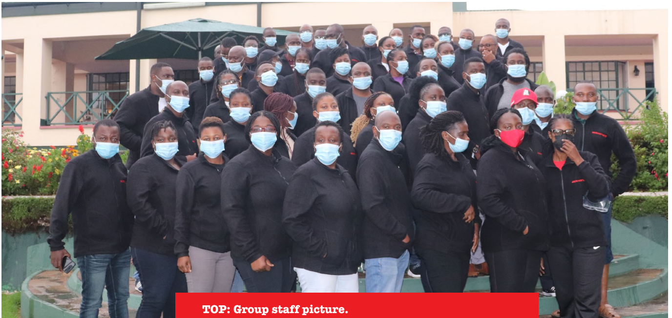
TOP: Group staff picture.

and efficient ways of working as a team, building on the strengths and skills of each member by fostering innovation and creativity. The team building programme, which comprised indoor and outdoor exercises was held at Montclair Hotel in the resort town of Nyanga.