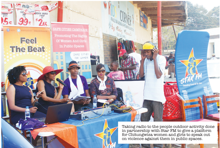
Taking radio to the people outdoor activity done in partnership with Star FM to give a platform for Chitungwiza women and girls to speak out on violence against them in public spaces.

goes to the Zimbabwe Women Lawyers Association (ZWLA) for teaching me and other women about our rights as women. Gone are the days when men could freely mock and insult women in public spaces, now we can stand up and defend our rights so much so that even the rate of domestic violence has decreased. ActionAid Zimbabwe was implementing the She Can Project together with SAYWHAT and ZWLA in Chitungwiza and Dzivarasekwa.