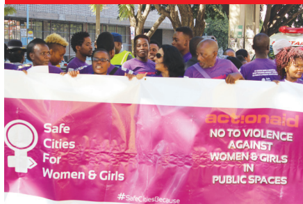
ActionAid, partner staff and volunteers during a Safe Cities Day commemoration.