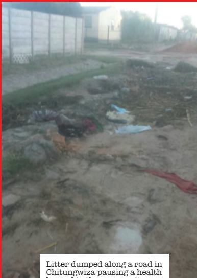
Litter dumped along a road in Chitungwiza pausing a health hazard in the community

By Tanyaradzwa Ndlovu Winnet Muranganwa Rudo Mupotsa and Ashley T.M Dzobo Safe Cities Volunteers