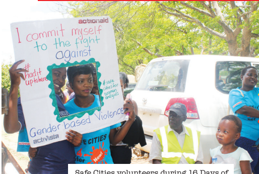
Safe Cities volunteers during 16 Days of Activism against gender based violence commemorations in December 2016.