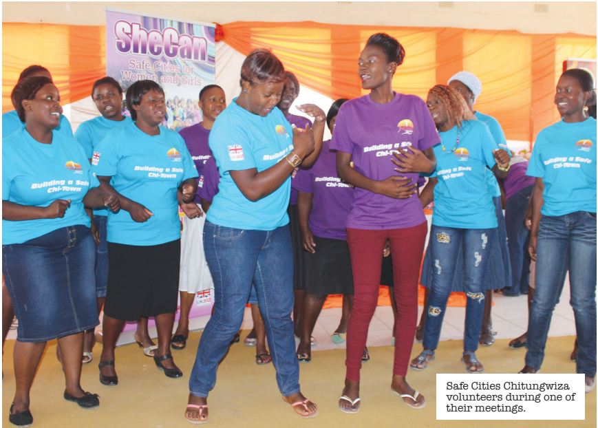
Safe Cities Chitungwiza volunteers during one of their meetings.

for bail but was not granted. He was sent to Chikurubi maximum prison where he will be serving a six (6) year jail sentence.